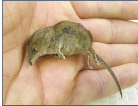
Townsend's Vole Microtus townsendii